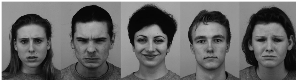
Figure 1. Exemplary stimuli (afraid, angry, happy, neutral, sad) chosen from the KDEF picture set (Lundqvist et al., 1998).

Eye movements were recorded by a monocular video-based, high-speed tracking system with 1250 Hz, (iView X Hi-Speed, SMI, Berlin, Germany). Participants were seated in front of the computer screen, the chin was placed on a chin rest to view the computer screen through the mirror-glass, which was used to reflect the eye, and the infrared light point tracked the eye movements with the camera placed above (for more details, see: Alpers, 2008). Location, time, and duration of all fixations were analyzed. Eight different areas of interest (AOI) were defined: forehead, left eye, right eye, left cheek, nose, right cheek, mouth, chin, and any other parts of the head. Fixations were defined as a gaze that remained in a diameter of 25 pixels for at least 100 ms.