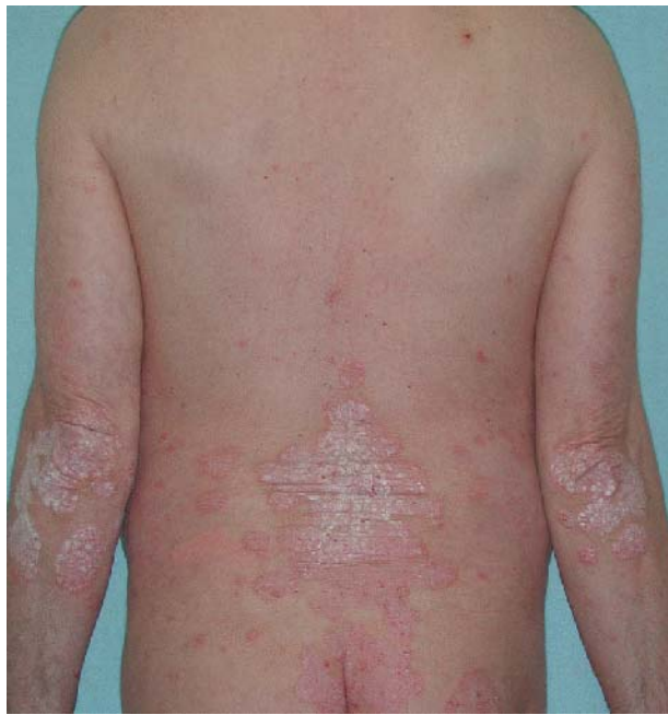
Figure 1 Symmetrical distribution of psoriatic lesions on the back and elbows.

various types and presentations of psoriasis are outlined below.