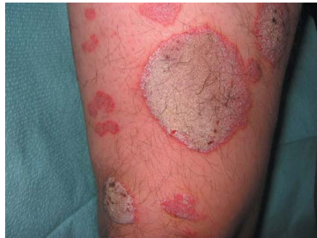
Figure 2 Nummular (coin-sized) lesions of psoriasis.

Guttate psoriasis, from the Greek word gutta meaning a droplet, describes the acute onset of a myriad of small,