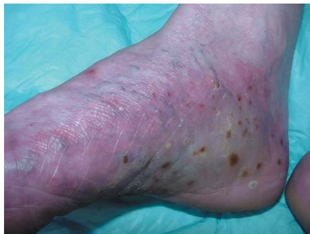
Figure 3 Palmoplantar pustulosis.