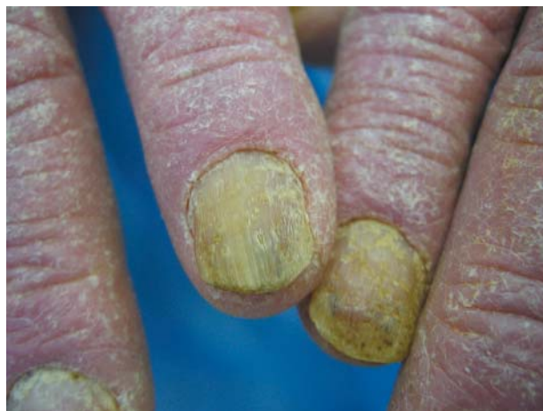
Figure 5 Nail plates in a patient with psoriasis. They are thickened, dystrophic, and show orange-yellow areas (oil spots).

everyday disability leading to depression and suicidal ideation in more than 5% of patients. 28