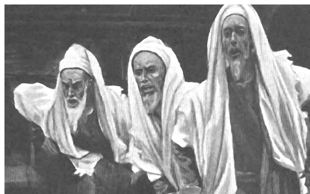
The Pharisees accusing Jesus, by James Tissot, 1856-1902

Lust includes all forms of sexual impurity, unchastity, and undue desire for sexual gratification, whether with others or with oneself. Lust treats others as objects for personal gratification, rather than as persons worthy of self-sacrificing love. Selfish satisfaction is all that matters. Because lust seeks some of the greatest physical pleasures the body can know,