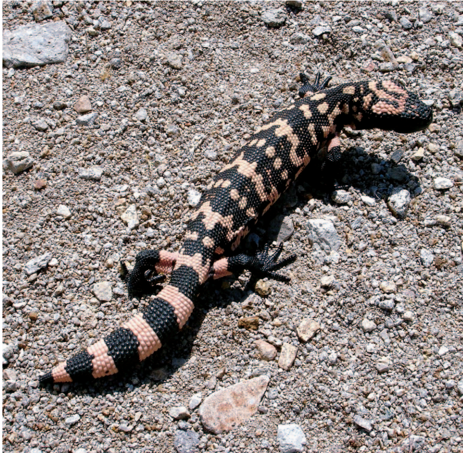
Fig. 8. Gila monster from the Kingston Range, San Bernardino County, California. Details of the sighting will be reported elsewhere.