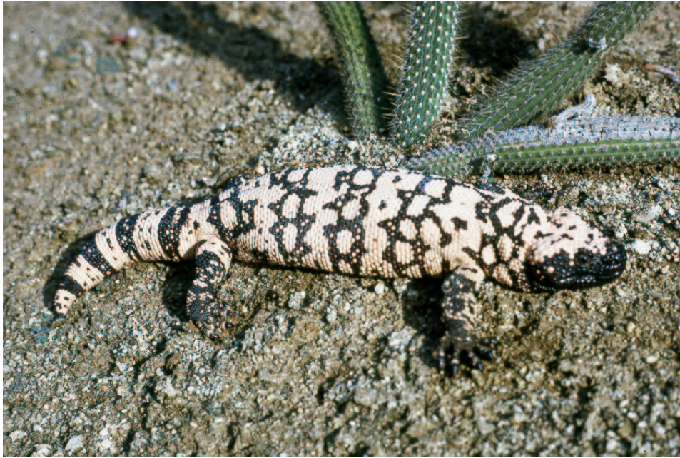
Fig. 3. Same Gila monster in Figure 3 photographed while at the Los Angeles Zoo.

desert at that time, and the fact that the specimen was diagnostic of the geographically expected race, H. suspectum cinctum . Figures 2 and 3 clearly show the banded pattern typical of this subspecies. De Lisle (1986) indicated that specimens from the Providence Mountains were mostly pink with a reduction in black pigmentation relative to other H. suspectum .