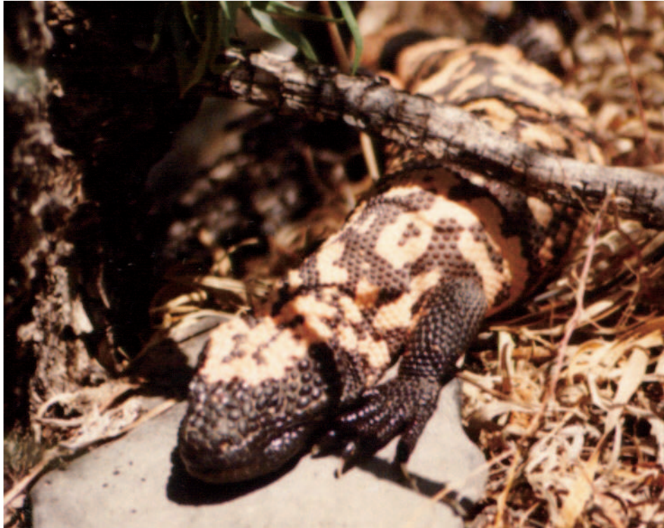
Fig. 4. The Gila monster from Piute Springs (see caption of Figure 3) in riparian streambed. LACMPC #1364c.

litt. ). When observed, it was in a streambed among vegetation and surface litter. The temperature at the time was 18.3° C under sunny, mostly clear skies with winds of 8–16 kph. It had rained “several” days prior to the observation. The elevation at the site is 853 m. Piute Creek is the only perennial stream for many kilometers around and is characterized by typical desert riparian plant species including Salix sp., Baccharis viminea , Prosopis sp., and Tamarix ramosissima . A subsequent herpetological survey of the site did not detect Gila monsters (Hazard and Rotenberry 1996).