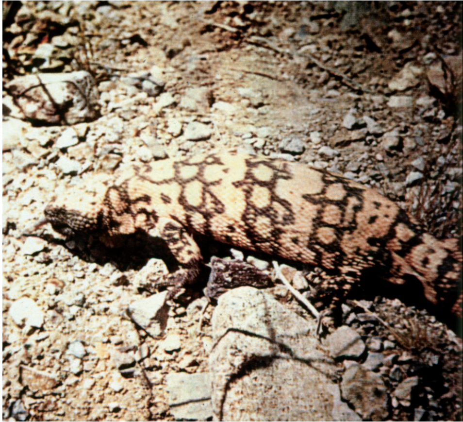
Fig. 2. The Gila monster from the Providence Mountains, Vulcan Mine Road, 16 April, 1968, 1000 hr. Photo is catalogued as Los Angeles County Museum Photographic Catalog (LACMPC) #1331.

is not the westernmost record of Gila monsters from this area (Funk, 1966). Due to the meandering course of the Colorado River, specimens from near Yuma, Arizona were found about 14.5 km west of the California record above.