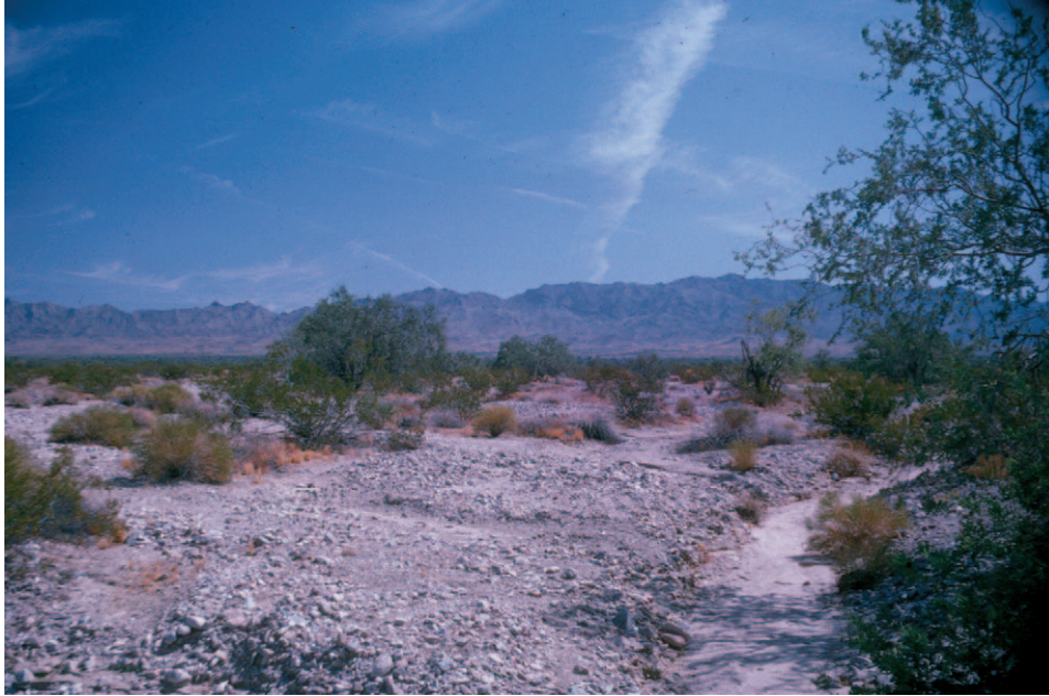
Fig. 1. Ironwood wash woodland near Palen Pass, Riverside County, California. Granite Mountains are in the background.

hillslopes (Figure 1). The Chuckwalla Valley ranges from 200–350 m at the base of the Granite Mountains.