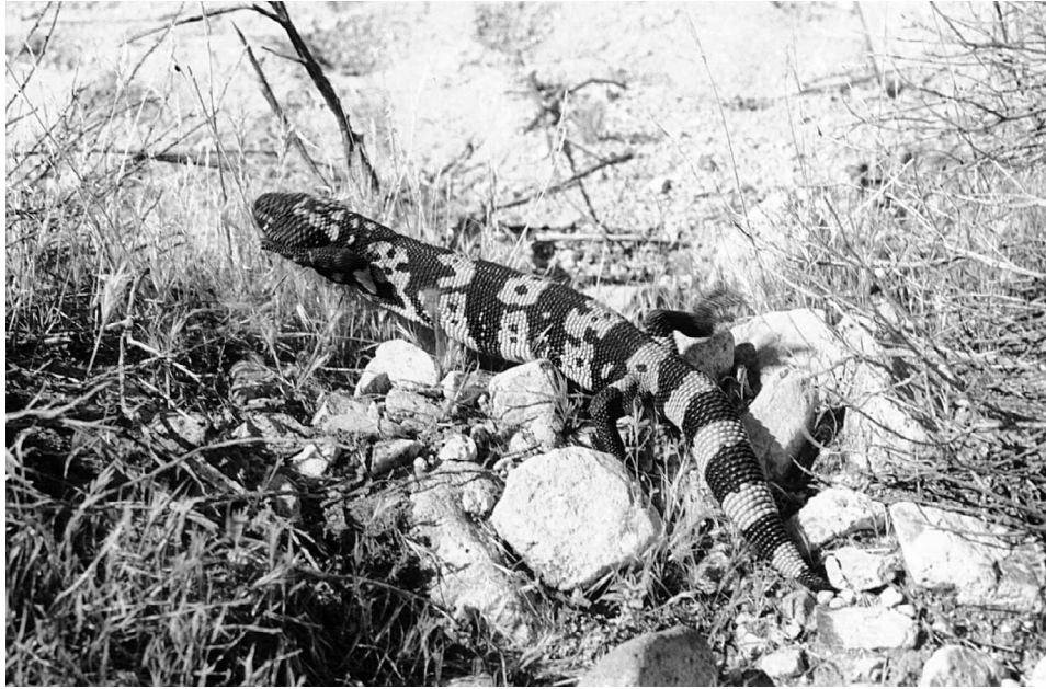
Fig. 6. Gila monster from the Kingston Range, San Bernardino County, California, 1.4 km west Porcupine Flats. 30 May, 1980. LACMPC #1329.

Clark Mountain. —At almost 2,400 m, Clark Mountain is the highest of the east Mojave sky island mountain ranges in California. Bradley and Deacon (1966) reported a specimen collected from the eastern slope of the Clark Mountains in 1962 now in the collection of the Marjorie Barrick Museum of Natural History at the University of Nevada, Las Vegas (#R 665, Figure 9). The snout-vent length of the specimen is 267 mm with a total length of 40.5 cm. This collection site is about 11 km southwest of the California-Nevada state line. Several other specimens were reported from nearby Clark County, Nevada, and all were collected at elevations below 1219 m (Bradley and Deacon 1966).