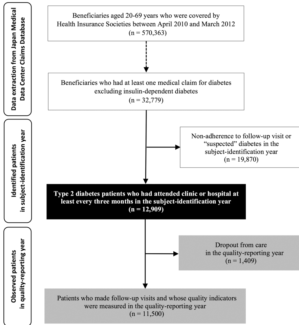
Figure 1 Flow diagram to identify patients with type 2 diabetes.

hospitalized, in the subject-identification year. This definition of adherence to follow-up visit was recommended as a quality indicator in a previous study. 38 We defined non-adherence to follow-up visits (no visits to the clinic or hospital for 3 months or more) in the quality-reporting year as a 'dropout'. We assessed inpatient as well as outpatient claims records in the quality-reporting year to identify whether patients adhered to follow-up; we also evaluated the number of tests performed during hospitalization.