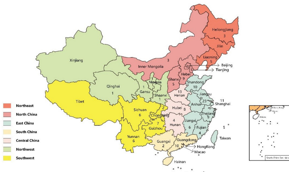
Figure 2 Geographic distribution of the 155 metabolic management centers in China involved in this study.

value 92.8% (95% CI: 92.4% to 93.1%), respectively. The interobserver variability (setting one grader as reference standard) between two primary expert graders had a sensitivity of 69.6% (95% CI: 68.4% to 70.8%) and a specificity of 86.8% (95% CI: 86.4% to 87.2%), with positive predictive value 53.1% (95% CI: 51.9% to 54.2%) and negative predictive value 93.0% (95% CI: 92.7% to 93.3%).