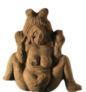
Fig.7. A terracotta statue of goddess Baubo, British Museum, 1. 886,0401.1452. After; http://www.britishmuseum.org/naukratis 30/11/2022.

A woman in a crouching position. Sitting with her legs spread wide. She is covered only by a sleeveless dress with tightly fitting cuffs that, presumably, crossed her shoulders. Both hands are lifted just over her shoulders, the arms are bowed at the elbows, and the left hand is holding a little pot while the right hand is palm outward. It has been suggested that this and similar types have been connection with the Eleusinian mysteries and the story of the goddess Baubo and Demeter. According to the legend of Demeter, Baubo claimed to be a lame servant of King Celeus of Eleusis, observed the grieving goddess and tried to help her with cheering the goddess with raising her skirt, and exposed her body to the goddess Demeter. According to the Iambe story, Iambe was the first Demeter's priestess.