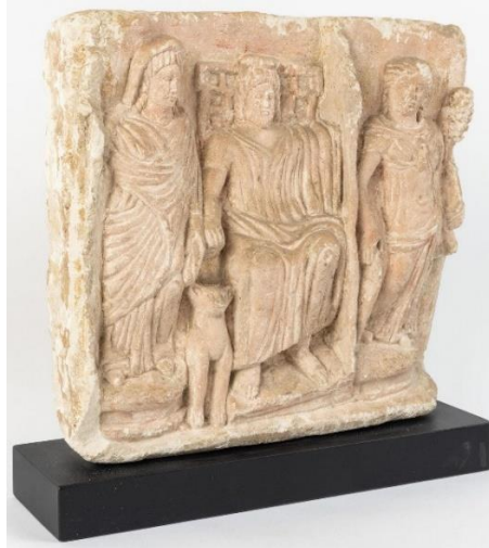
Fig.12. A Relief representing a divine triad, Boston Museum. After; https://www.numisbids.com/n.php?p=lot&sid=4684&lot=1099 on Classical Numismatic Group, LLC