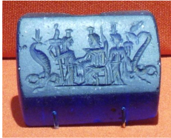
Fig.11. Plaque depicting Thermouthis, Demeter, Serapis, Isis, Agathodaimon, Metropolitan Museum, 1976.52. After; https://www.metmuseum.org/art/collection/search/547872 accessed on 3/6/2021.

Serapis is flanked by Isis who appears to hold a cornucopia, with her cloak tight on the chest in the typical knot of Isis and goddess Demeter with her torch, as she is always represented holding one or two torches 63 . Behind Demeter is Thermouthis 64 , an old goddess from the Old Kingdom who was represented as a cobra serpent wearing Hathor's crown.