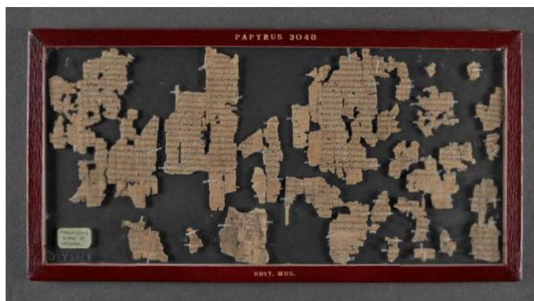
Fig.2. Satyrus, P.Oxy. XXVII, London, British Library Pap 3048 . After; Digital Corpus of Literary Papyri. On Creative Commons Attribution 3.0 License .

Fragmentary columns preserving portions of Satyrus' treatise 'On the demes of Alexandria'. Explanations of the names of tribes and demes are given and directions for a procession in honour of Arsinoe Philadelphus are provided, with instructions about the route and the dignitaries involved and about places where personal sacrifices may be offered.