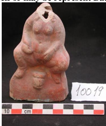
Fig.8. Figurine of a Woman Purifying herself, may be represented Baubo. After; Ibrahim, N., (2020). Two unpublished figurines, p. 645: 664, Fig.1.