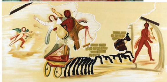
Fig.10. Second room of the house tomb M3, Tuna El-Gebel. The back wall depicts the rape of Persephone. After: Lembke, K. (2014). City of the Dead: The Necropolis of Tuna el-Gebel during the Roman Period. Egypt in the First Millennium AD: Perspectives from New Fieldwork. , British Museum Publications on Egypt and Sudan 2, p. 83, pl. 7.

The funerary house no. M3 57 consists of two chambers. The second chamber in this House tomb dominates a funeral niche. This niche houses a brick-built klinè with a different conception from the one in the House of the Dionysiac Krater. Simple legs are engraved on a structure that is otherwise painted to appear as if it were made of bricks, with dark lines defining the mortar, elaborating on itself and other brick-built banquettes at Tuna el-Gebel in a postmodern manner. Two columns flank the klinè niche, each painted to seem like green, variegated grass. A vaulted roof is supported by marble columns.