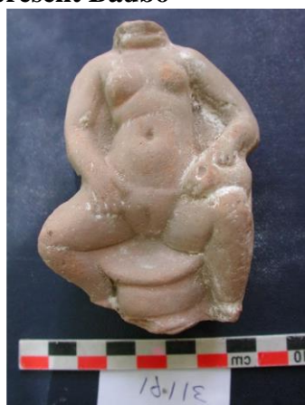
Fig.9. A woman Figurine Purifying herself, may be represented Baubo. After; Ibrahim, N. (2020). Two Unpublished Figurines, p. 645: 664, Fig. 2.