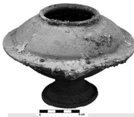
Fig.4. Eleusinian vase, Chatby, Graeco-Roman Museum, no. 15580. After; Mitsopoulou, Chr. (2016). Two Eleusinian Vases from Alexandria , p. 161, pls. 1, 2a-b, fig. 1.

Description 42 The base is large, stepped, sculpted, and open in appearance. The lid is plainly made of dark brown clay, and it has a thick coat of white wash over it, with vestiges of other painted banded artwork that are now hardly visible. It has a high, bell-shaped appearance and is topped by a flat knob. There are triangular incisions on the upper half; the rim is not modelled, and the wall is straight.