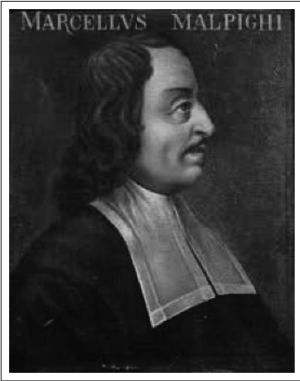
Figure 1. Portrait of Marcello Malpighi in the office of the Rector of the University of Bologna. Marcello Malpighi has represented a continuous example for the students and teachers of the University of Bologna. He has been considered a friendly mentor and tutor (oil on canvas, author not known).

essays, describing in detail the gross and microscopic characteristics of the brain, of all sensory organs, of the liver, and kidney. The reaction by the other faculty members in Messina was even worse than in Bologna.