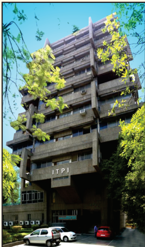
ITPI HQ, New Delhi