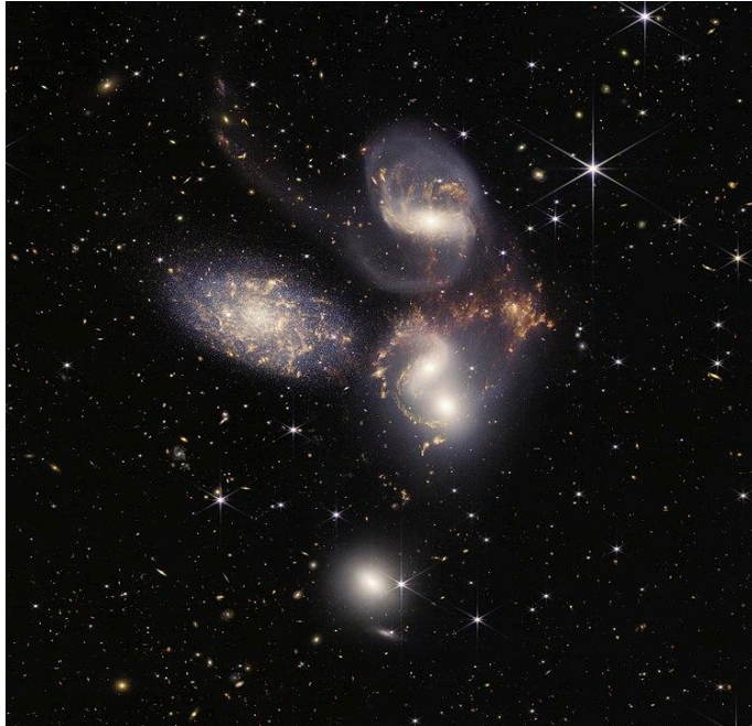
Figure 1: Stephan's Quintet taken by James Webb Space Telescope (NASA, ESA, CSA & STScI, 2022).