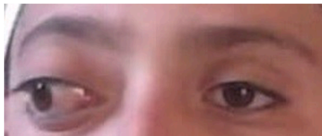
Fig. 3. Preoperative images showing proptosis of the right eye.