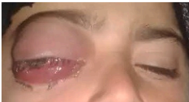
Fig. 1. Preoperative images showing severe chemosis and proptosis of the right eye.

displacement of the globe and caused outward bowing of the orbital structures with no associated bone destruction and the CT images revealed a medial right orbital cystic mass with rim enhancement and globe displacement [Fig. 2]. The patient received oral albendazole 400 mg once daily for 8 weeks pre operation. Following treatment symptoms of eye swelling and chemosis reduced, however proptosis still remained significant [Fig. 3]. The orbital hydatid cyst was surgically removed via orbitotomy. Due to its medial extraconal location within the orbital cavity, the surgery was conducted using a transcaruncular (medial transconjunctival) incision. Although the cyst was ruptured during the surgery but whole capsule and its contents were suctioned subsequently, the orbital cavity irrigated with normal saline prior to wound closure and wound closure made by 6/0 Vicryl sutures. Immediately after surgery Oral albendazole advised 400 mg once daily for 12 weeks. There was no clinical recurrence of proptosis after follow up imaging and normal vision 6/6 and postoperative showing resolving of the chemosis and proptosis of the right eye. Fig. 4 also shows right exotropia post-treatment, indicative of residual ophthalmoplegia [Fig. 4]