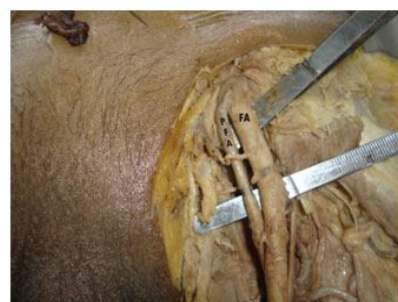
[Table/Fig-3]: High origin of Profunda Femoris artery (PFA) from medial side of Femoral Artery (FA) with all superficial branches and circumflex arteries from PFA, MCFA (medial circumflex femoral artery) & LCFA (lateral circumflex femoral artery)