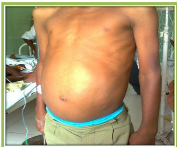
[Table/Fig-1]: Clinical image of the left sided lump in abdomen

left kidney was non-functioning with no uptake of contrast, while the right kidney showed moderate hydronephrosis with dilatation of proximal ureter with delayed uptake and retention of contrast, which were suggestive of stricture in right sided mid ureter [Table/Fig-2,3]. Micturating cystourethrogram (MCU) did not show any vesicoureteric reflux or posterior urethral valve. On MCU the bladder was normal [Table/Fig-4]. Tc99m Diethylene Triamine Pentacetic Acid (DTPA) scan showed non-functioning left kidney. Right side kidney showed decreased function with a glomerular filtration rate (GFR) of 40.44ml/min with a 100% retention at two hours with retention in proximal ureter also. On bilateral retrograde ureteropyelography (RGP), bilateral mid ureteric stenosis at the level of pelvic brim was documented. The length of stenosed segment on right side was approximately of 2 to 3 cm and that on left side was 4 to 5 cm. Left sided nephroureterectomy was done through flank incision, approaching extraperitoneally. Intraoperative findings were suggestive of a tight stenotic segment of left midureter with normal calibre ureter distal to it. On right side, extra peritoneal ureteric exploration was performed using a modified Gibson incision. On right side also a similar appearance of the mid ureter was seen but of a shorter length as compared to left side. The stenosed segment