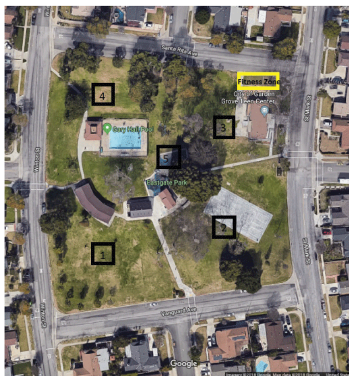
Figure 2. Aerial map of Eastgate Park, Garden Grove, 2015. Researchers divided the park into 5 target areas. Target area 3 encompasses the site of the fitness zone, which was installed in December 2015. Image obtained from Google Maps ( www.google.com/maps/place/Eastgate+Park/@33.7884134,-118.0346572,156m/data=!3m1!1e3!4m5!3m4!1s0x80dd2f26e4a34b8b:0xfb28efa20564369!8m2!3d33.788409!4d-118.03411 ), and graphics were added by the researchers.

preintervention (before installation of equipment) and postintervention (after installation), we used the System of Observing Play and Recreation in Communities (SOPARC), a standardized observation tool (16). To quantify physical activity in the park as a whole, we divided Eastgate Park into 5 target areas (Figure 2). Trained researchers made preintervention observations during 3 days in 2015 (August 29, August 31, and September 2) and postintervention observations during 3 days in 2016 (February 1, February 3, and February 6). Each target area was monitored by a researcher during 4 one-hour intervals (7:00 to 8:00 AM, 12:00 to 1:00 PM, 3:30 to 4:30 PM, and 6:00 to 7:00 PM) on all 3 study days (Monday, Wednesday, and Saturday). According to SOPARC guidelines, we divided each hour into 15-minute increments, and we sampled user activity continuously during each increment.