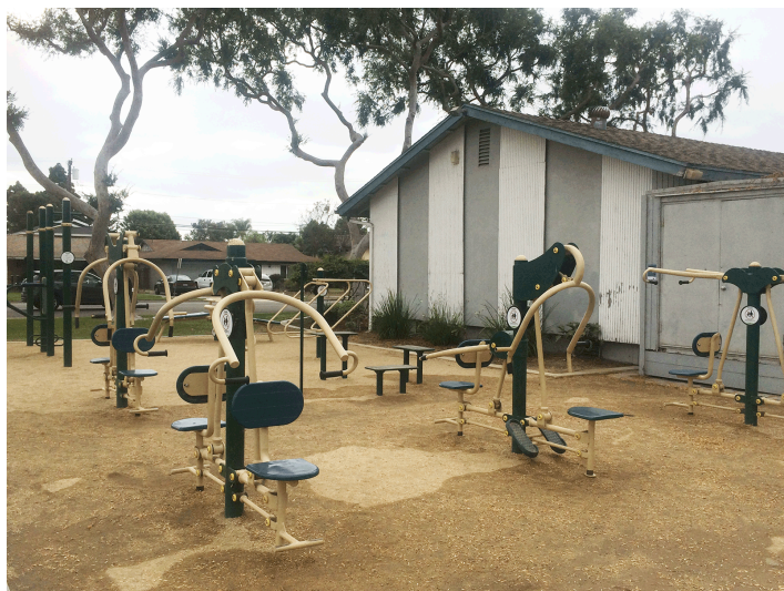
Figure 1. Fitness zone in Eastgate Park, Garden Grove, 2016.

Eastgate Park is a 4.5-acre park in a suburban community in northern Orange County and has amenities such as open green space, a children's playground, a community pool, a meeting facility, and a covered picnic area. The fitness zone in Eastgate Park was installed in December 2015 in a previously open space. The city's parks and recreation department worked with Greenfields Outdoor Fitness Equipment, Inc (15), an Orange County-based company, to install 8 pieces of equipment: a 2-person lateral pull, a 2-person back and arms combination resistance, a 2-person vertical arm press, a 2-person chest press, a set of combination bars, a 2-person sit-up bench, a parallel dip and stretch machine, and poly-metric steps (Figure 1).