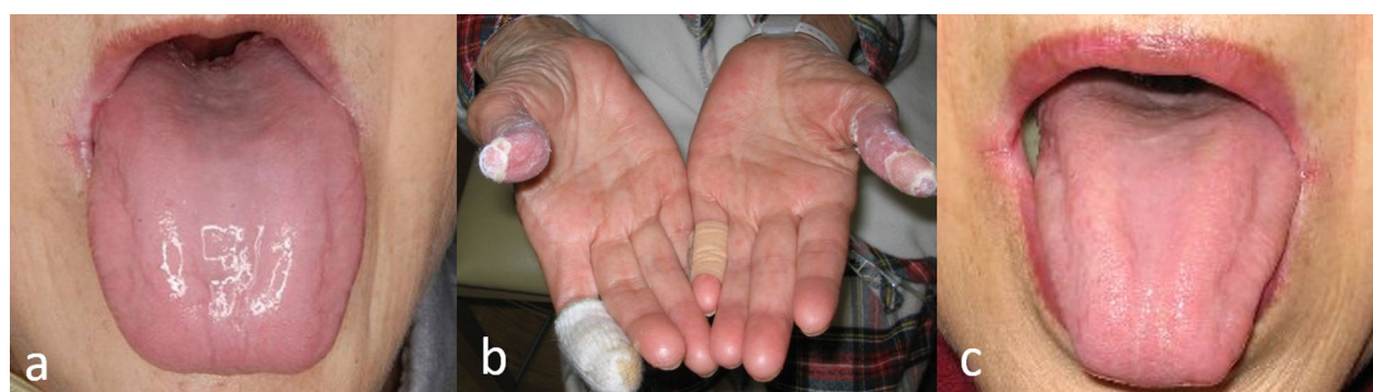
Fig. 1 a Glossitis with atrophy of the lingual papillae and erythema. b Picture of the bilateral thumbs showing acrodermatitis enteropathica-like eruption and abnormal keratinization. c Picture showing improved atrophy of the lingual papillae as a result of proper zinc supplementation, but refractory angular cheilitis