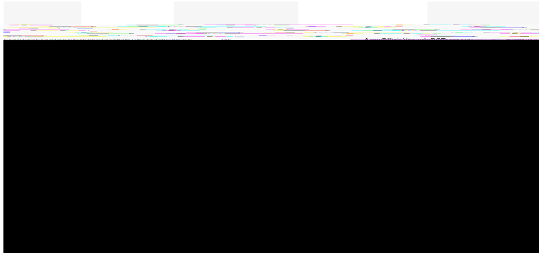
Figure 1 Timeline of the development of preclinicaltrials.eu (PCT).

preregistration among researchers, see table 1 ). Most information required for registration would likely already be documented in a study's experimental protocol, which is often required for approval by a local committee, as per our experience with such applications in the Netherlands. We simultaneously set out to further reduce the administrative burden for researchers by enabling an automatic transfer of the required information from local digital systems to the PCT format. After reaching out to developers of such software, this function is now in place for PRIS, a system used in several institutes in the Netherlands for animal study protocols submission to local animal welfare bodies. This allows researchers to copy most of the required information from their local application form to PCT with the click of a button. Discussions with other software developers are ongoing.