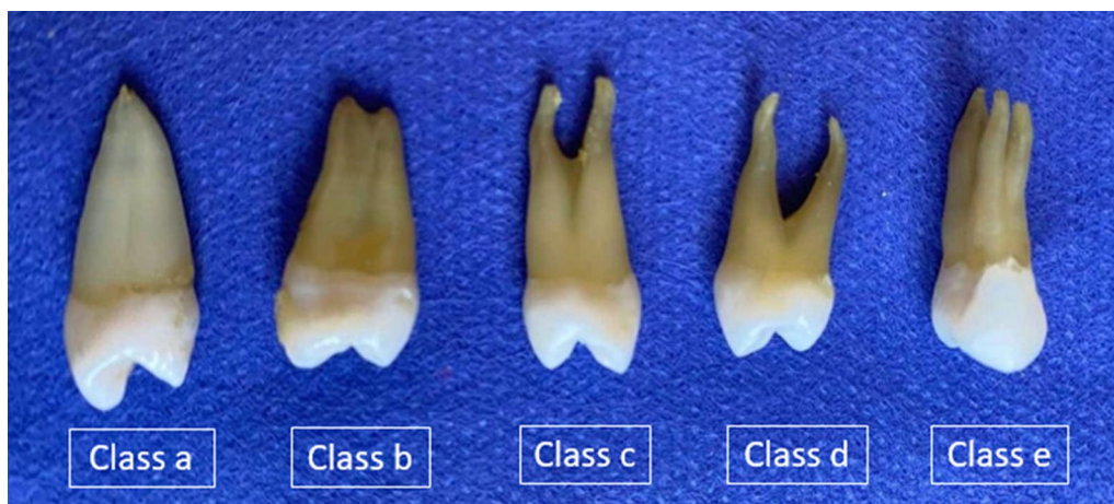
Fig. 1 Diagrammatic representation of the morphology, number, and different classes of maxillary premolar root