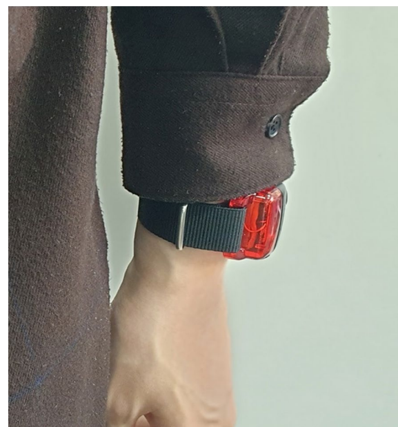
Fig. 1 Wrist worn accelerometer