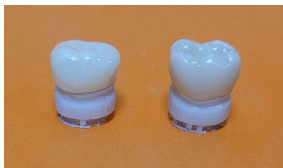
Fig. 2 Prefabricated (on the left) and custom-made (on the right) zirconia crowns on corresponding dies