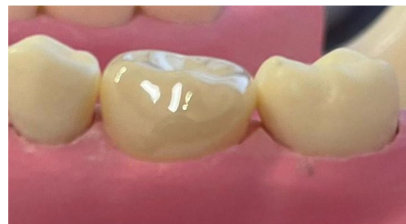
Fig. 1 Fitted prefabricated zirconia crown on the prepared educational model

All 16 crowns were cemented to their respective dies using glass-ionomer cement (Medicem, Promedica Domagkstrasse, Neumuenster, Germany). Each crown was placed under a static load of 50 N for 5 min, excess cement was removed, and the crowns were placed in distilled water at 37°C for 24 h.