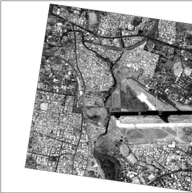
Figure 3 Warped Image using Wavelet Modulus Maxima

absolute value and location indicates the rotation and scale. A new image constructed by applying the rotation and scale and it is created by using bilinear interpolation. Once again by finding the phase correlation ratio of the newly generated image with the reference image, shift between the images are identified. The maximum absolute value of the Inverse FFT of this ratio provides the shifts in both x and y directions. After deriving all