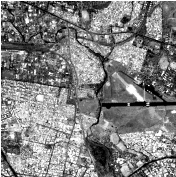
Figure-1 Reference Image

Indian Remote Sensing (IRS) PAN data sets are used to test these algorithms. Common data set of 512X512 is used to test all the algorithms, which is extracted from larger data sets to reduce processing time. The two data sets are acquired by the same sensor but at two different times. Figure 1 shows the data that is used as a reference image. Figure 2 shows the data which is to be warped.