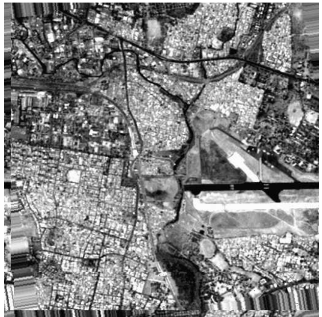
Figure 6 Warped Image using FFT

degrees. When the rectified image is swiped on the reference image it could be observed easily for its well registration. Figure 6 shows the rectified image.