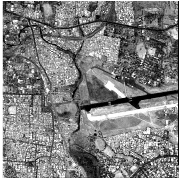
Figure-2 Input Image to be warped

The wavelet decomposition is carried out upto the third level. The actual feature point matching is achieved by maximizing the correlation coefficient over small windows surrounding the points with the LL sub bands of the wavelet