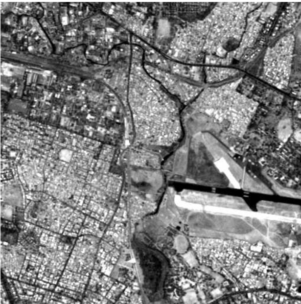
Figure 4 Simulated Image to be warped using FFT

absolute value and location indicates the rotation and scale. A new image constructed by applying the rotation and scale and it is created by using bilinear interpolation. Once again by finding the phase correlation ratio of the newly generated image with the reference image, shift between the images are identified. The maximum absolute value of the Inverse FFT of this ratio provides the shifts in both x and y directions. After deriving all