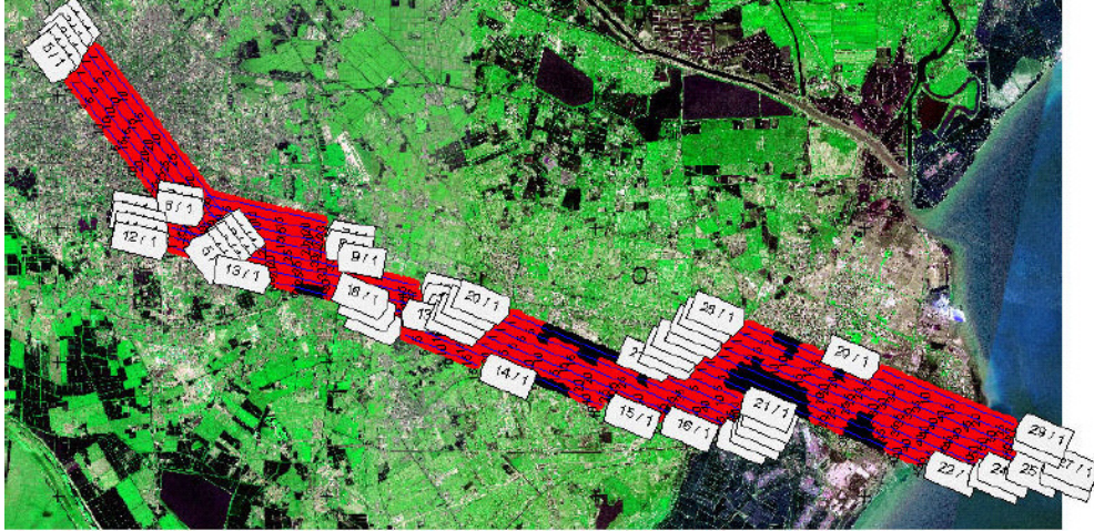
Figure 2. Mission planning of the Tianjin Haihe river project.

June 15, 16, 25 and 26, 2003, respectively. After direct georeferencing of aerial imagery orthoimages of the first two flights were generated. Figure 2 shows the mission planning results of the project. A mosaic of 5 \times 10 orthoimages is shown in Figure 3.