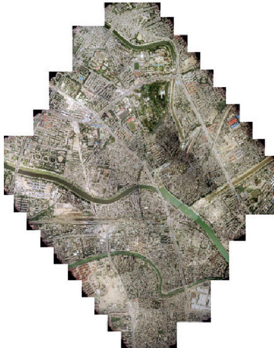
Figure 3. A mosaic of 5 \times 10 orthoimages of the Tianjin Haihe river project.