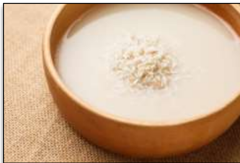
Figure 3: Rice water