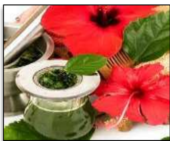
Figure 4: Hibiscus (33)